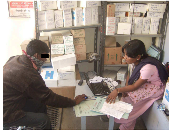
Figure 2. Patient (left) logging into the biometric terminal at a tuberculosis clinic. Each box in the background holds the drugs for one patient. The counselor is at right.

In order to prevent such tampering without impeding the usability of the terminal, we impose two security measures. First, new registrations and edits to patient data are locked unless a counselor has scanned her fingerprint within the preceding hour. This gives reasonable assurance that the counselor (who is trusted to modify all data on the machine) is either present or has recently left, in which case the clinic is likely to remain in active operation and tampering is less likely than at night. Second, to guard against unknown par-